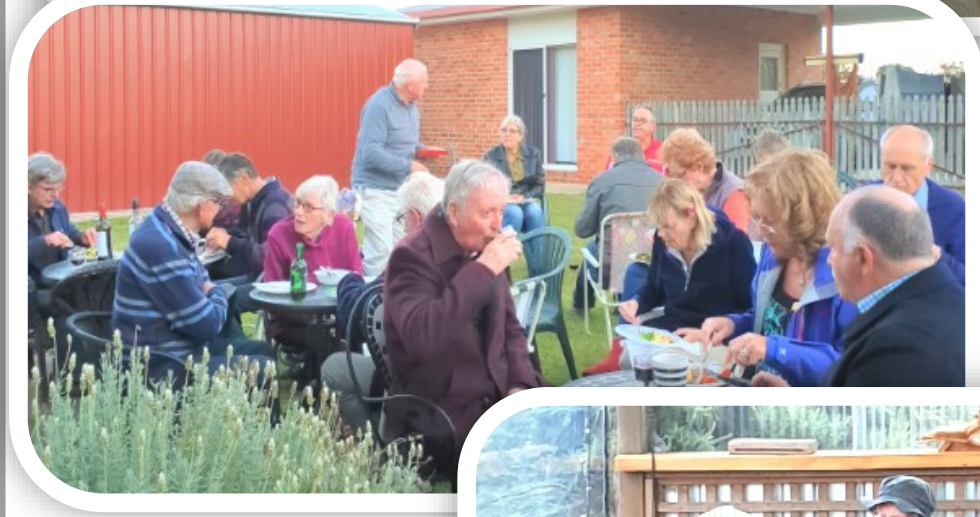
Some Rotary members and their guests relaxing at the Presidents BBQ